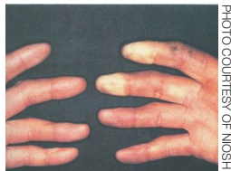
Hand Arm Vibration Syndrome