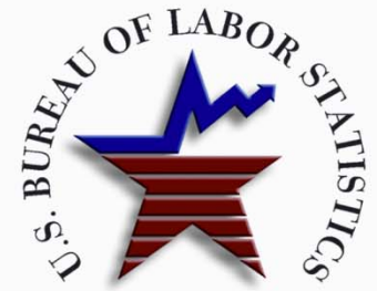
PPI Building Construction Indexes