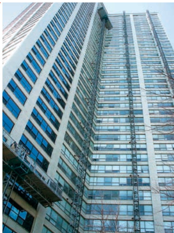
Mast climbers scale the exterior of a Chicago high-rise. Note that multiple towers are in place with platforms positioned in varying locations depending on the stage of work.

Another safety concern is the communication gap between the mast climber manufacturer and the equipment's end users. Without effective lines of communication, critical safety warnings and operating updates may never reach the people who most need the information. Distributors, suppliers and lessors of mast climbers must find ways to stay current on equipment updates and ensure that this information is provided to mast climber end users, including workers responsible for equipment operation, maintenance and inspection. Manufacturers must also make sure that this information is relayed to those who buy, lease, or use their equipment.