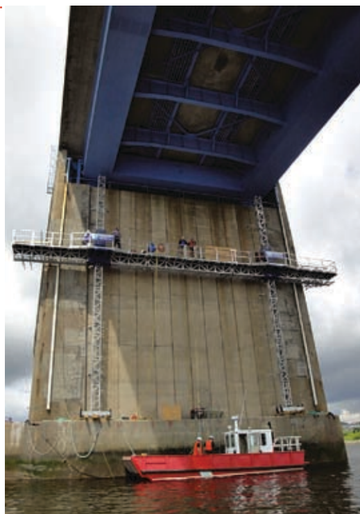
Use of twin masts on the Saint John Harbor Bridge Pier in Saint John, New Brunswick, Canada, illustrates the flexibility and small footprint of mast climbers.

this equipment sets the stage for more catastrophic – but entirely preventable – mast climber incidents. Recognizing the urgent need to prevent such incidents, CPWR convened the Work Group on Mast Climbing Work Platforms, whose recommendations are provided in the next section.