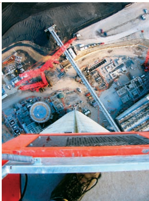
A bird's eye view from the platform of a mast climber.