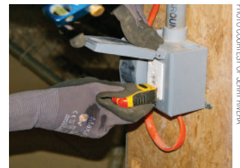
Testing a GFCI outlet to make sure it was wired correctly.

If working in wet or damp areas, use only tools or equipment designed and labeled for that use. Use ladders with nonconductive side rails if working near energized electrical equipment.