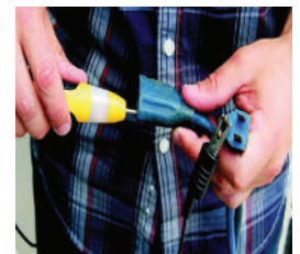
Competent person testing extension cord.

Ground fault circuit interrupters (GFCIs) save lives on job sites. The Occupational Safety and Health Administration (OSHA) requires employers to have GFCIs on all temporary wiring, and to assign a competent person to test the GFCIs and all cords on tools and equipment to make sure they are safe. You should hit the "test" and "reset" buttons on GFCIs to make sure they are working.