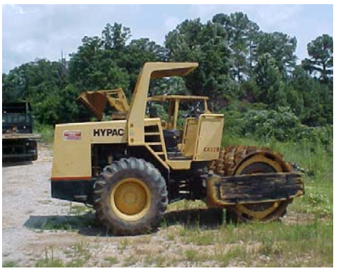
Figure 2 . A pad-foot compactor with a single drum and articulated steering.