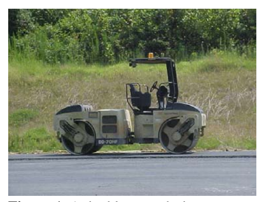
Figure 1 . A double smooth-drum compactor with an ROPS canopy and articulated steering.