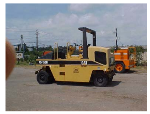
Figure 3 . A rubber-tired compactor with a two-post ROPS.