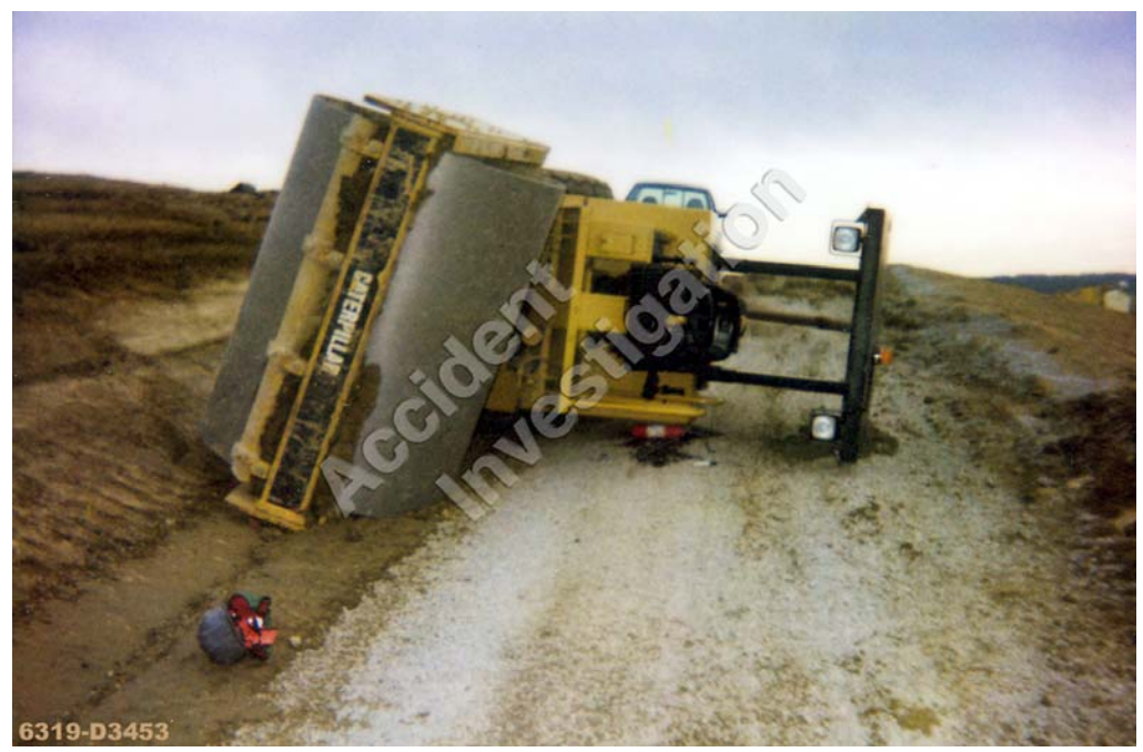
Figure 6. A compactor overturn that shows the anti-roll function of an ROPS