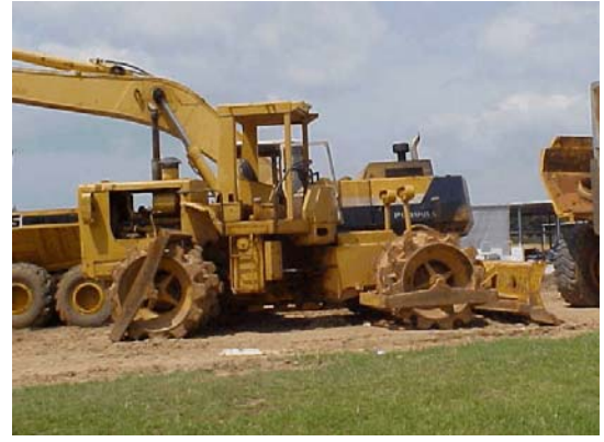
Figure 4 . A double drum pad-foot compactor with articulated steering and a four-post ROPS with a canopy.