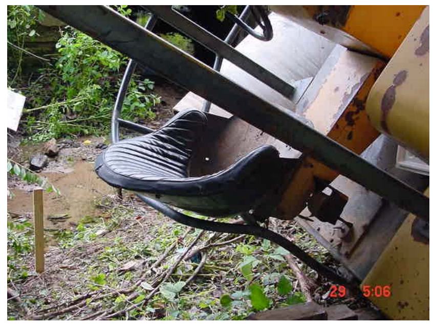
Figure 8. A seat and steering wheel perpendicular to the front of a compactor, which has no seatbelt; this unit was involved in an overturn-related death

Figure 7. Conditions contributing to overturns, by type of compactor and number of overturn incidents, 1985-2002