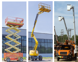
A scissor lift (left), a cherry picker (middle), and a bucket truck (right).

An aerial lift can prevent falls and reduce the risks for back, neck and shoulder injuries caused by working at or above shoulder level by positioning you where you need to work.