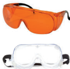
Choose safety glasses (top) with side shields.

Up to one in five work-related injuries cause TEMPORARY OR PERMANENT VISION LOSS. * If your job puts you at risk of an eye injury, OSHA requires your employer to provide proper eye protection.