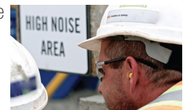
Worker using earplugs for hearing protection.

Make sure your hearing protection fits and is comfortable. The louder the job, the more hearing protection you need.