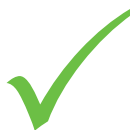
Fig. C - Back label will be marked with a green checkmark - OK for use.