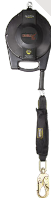
Diablo Big Block SRL