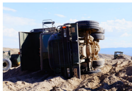
A dump truck tip-over that occurred while operating on a soft surface.