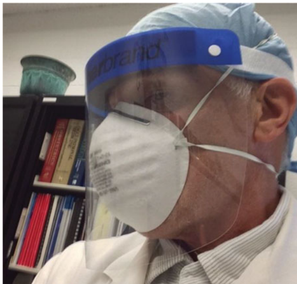
Figure 3. Disposable one-piece face/neck length face shield visor assembly with foam forehead cushion and elastic strap.

of the face shield visor. Some models also incorporate a brow cap (Figure 2) into the frame that affords additional splash protection in the forehead region, as well as allowing for more visor distance from the face that better accommodates the wearing of additional PPE (e.g., goggles, loupes, prescription eyewear, respirators) (Figure 2). Disposable visor-only face shields are also available that have a forehead foam cushion that provides a comfortable seal to the forehead (Figure 3).b