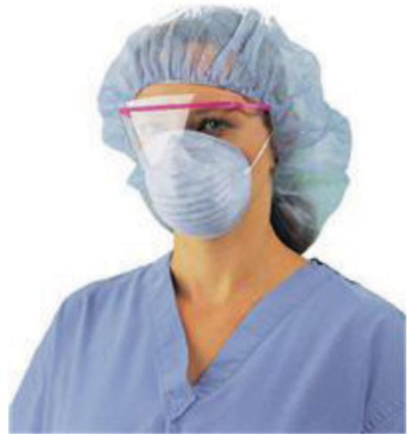
Figure 1. Half face piece face shield with eyewear-like temple bars.

with face shield wear. [9, 11] Visors can be treated with advanced coatings to impart anti-glare, anti-static, and anti-fogging properties, ultraviolet light (UV) protection, and scratch resistance features to extend the life of the visor. [11] Some models come with built-in goggles that are incorporated into the visor. [9, 10] Visors are available in different lengths that include half facepiece length extending to the mid-face, full facepiece length that extends to the bottom of the chin, and a face/neck length that also covers the anterior neck area (Figures 1 and 2). Most visors curve around the face and come in different widths; wider visors offer more peripheral protection. [9] Some one-piece face shields have visors that conform to the wearer's face upon donning (Figure 3). [10] Recommendations from the Centers for Disease Control and Prevention (CDC) are for visors that are of sufficient width to reach at least the point of the ear, [12] as this will lessen the chances of the likelihood that a splash could go around the edge of the face shield and reach the eyes. In addition, visors should have crown and chin protection for improved infection control purposes. [7, 13] Some models of disposable medical/surgical face masks are available with an integral, thin plastic visor fitted to the top of