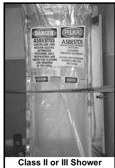
Class II or III Shower

Either clean your respirator in the shower or place it in a tub for transfer to a facility that will clean it for you. Leave the shower and enter the clean room.