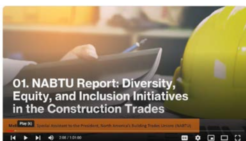
Why We Need More Women in Construction

In the first of three sessions, panelists reviewed current employment trends and discussed the importance of hiring women to address labor shortages and other benefits to employers and employees.