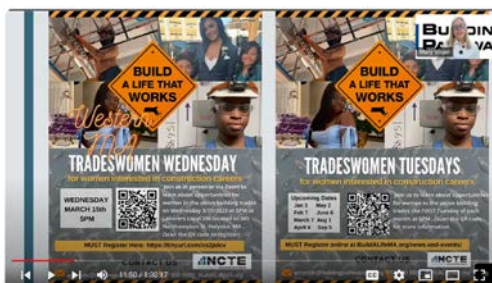
Strategies to Recruit and Retain Women in Construction

Learn what inclusive, diverse, and equitable workplaces look like in the construction industry and how they can be achieved.