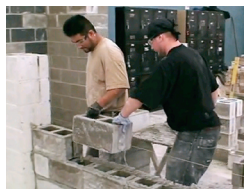
Workers use the two-mason lift technique to reduce stress of lifting and twisting.

Re-position your body so that you are not contorted or repeating a motion. Raise your work to waist level. Have materials delivered near your work. Take rest breaks. When you are tired, you can get injured more easily.