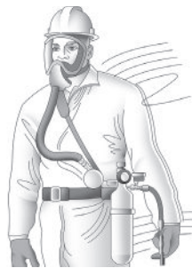
Full Facepiece Supplied-Air Respirator (SAR) with an auxiliary Escape Bottle