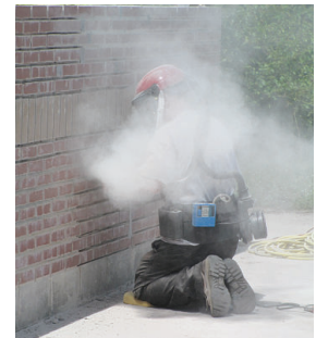
Grinding without LEV

Grinding or cutting out mortar between bricks or blocks during tuckpointing operations generates clouds of dust. The amount of silica in this dust may be hundreds of times higher than legal or recommended limits. Construction workers who breathe dust containing silica are at risk for serious diseases such as silicosis, lung cancer, chronic obstructive pulmonary disease (COPD), and other diseases associated with silica exposure. Portable local exhaust ventilation (LEV) that draws the hazardous dust away from the worker's breathing zone and does not interfere with the work can significantly reduce the health risk.