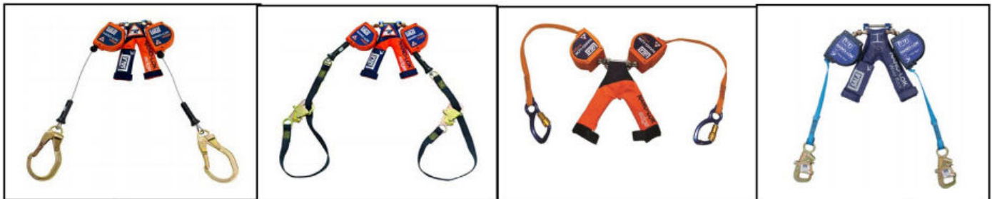
Twin-Leg Nano-Lok™ edge and Twin-Leg Nano-Lok™ Wrap Back